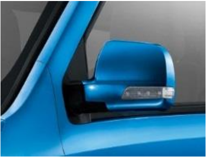
Rear view mirror with blinker lamps