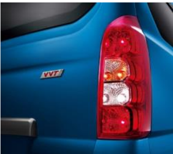
Integrated rear lamps