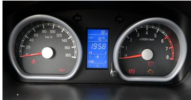
Gray interior trimming