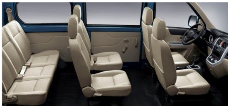
LUXURY type (2+2split+3)