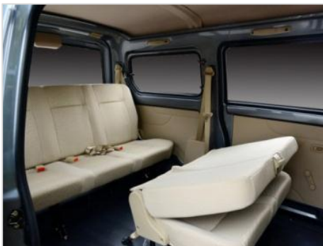
STANDARD type (2+2 conjoined+3)