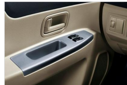
Power front windows