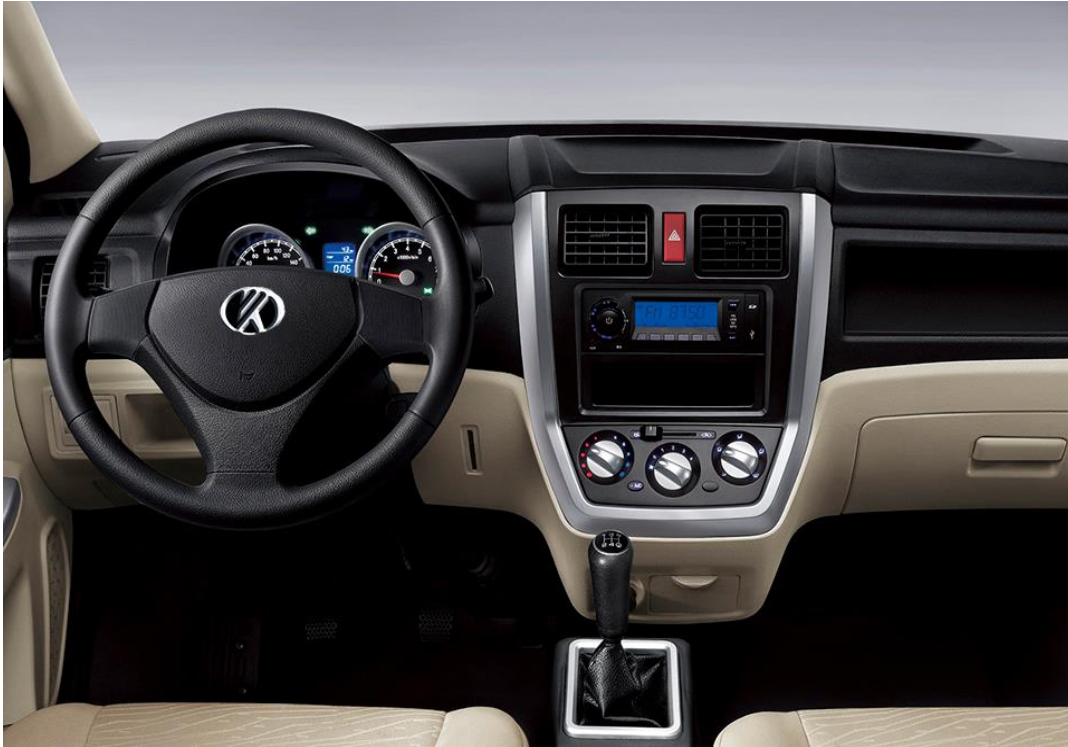
Beige interior trimming