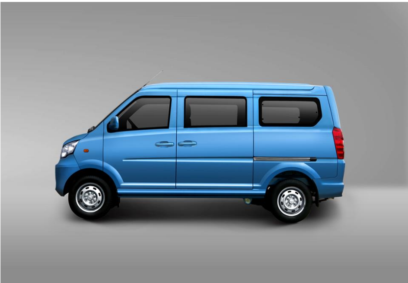
Black film on B & C column